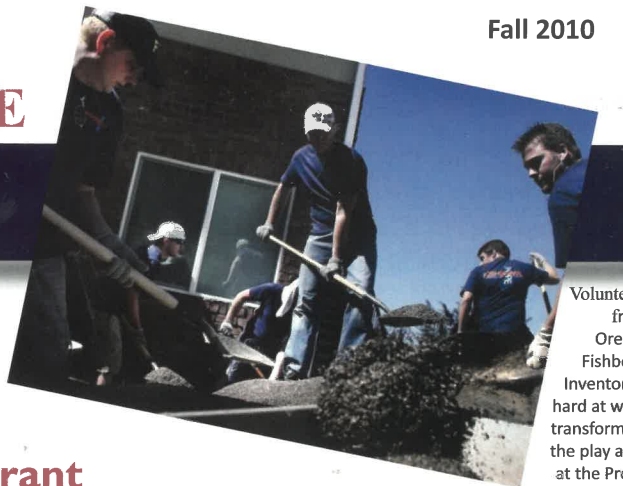
Volunteers from Orem's Fishbowl Inventories hard at work transforming the play area at the Provo facility.